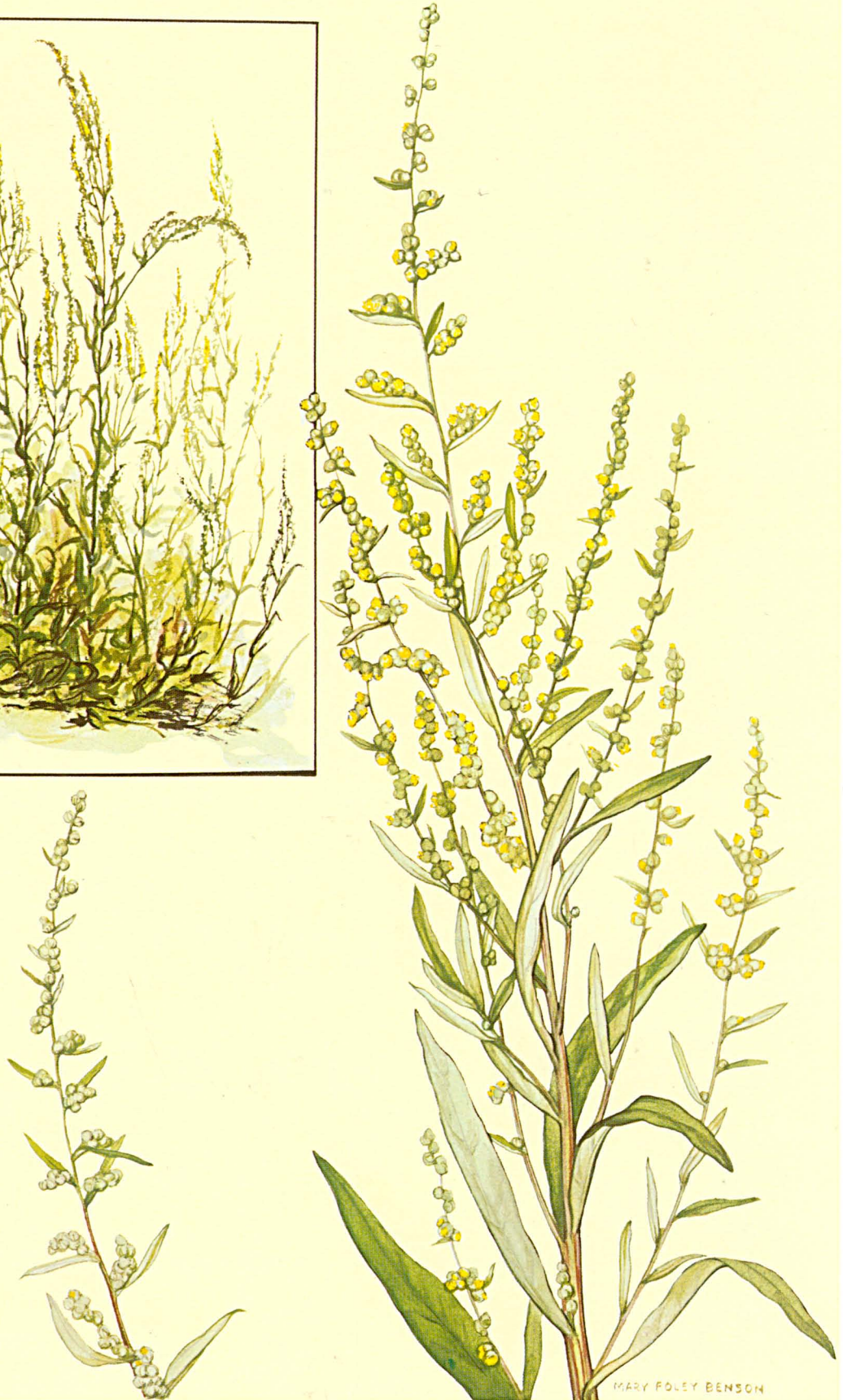
Artemisia vulgaris var. heterophylla (Mugwort)